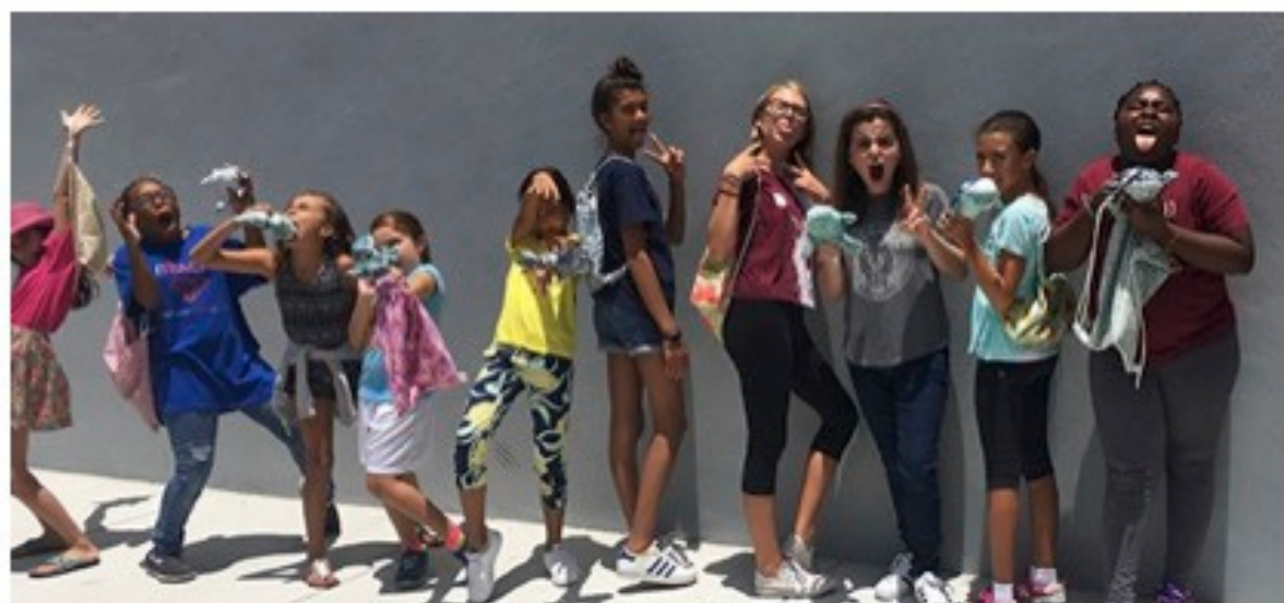
Students from Sewing Week Posing with their handcrafted stuffed animals and drawstring backpacks