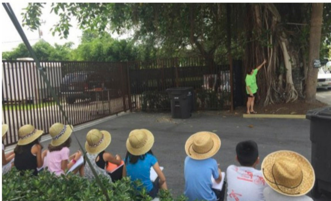
Students learning how to draw trees for a larger project during our Painting week